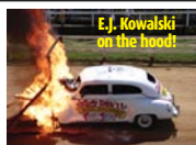
E.J. Kowalski on the hood!

SATURDAY at 3:00 pm—Daredevils in antique cars and motorcycles