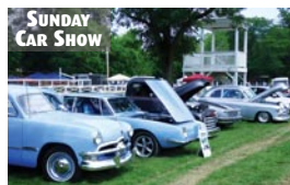
SUNDAY CAR SHOW

CRUISE-IN: CLASSIC CARS, MUSCLE CARS, STREET RODS, AND DRAG RACING CARS , awards offered.