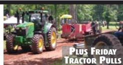
PLUS FRIDAY TRACTOR PULLS