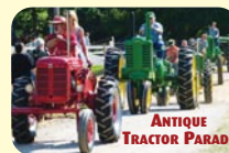
ANTIQUA TRACTOR PARADE

4:30 pm— ANTIQUA TRACTOR PARADE through the Fairgrounds and infield.