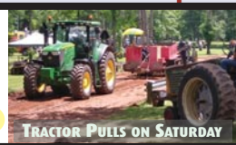
TRACTOR PULLS ON SATURDAY