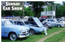
SUNDAY CAR SHOW

ANTIQUÉ, CLASSIC CARS, and HOT RODS, on display in the track's infield.