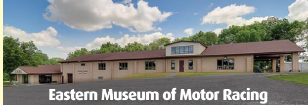
Eastern Museum of Motor Racing

5 pm- Race cars need to be at Williams Grove Speedway by 5:00 pm for EMMR Static Display. Questions? Contact Beth Wishard at 717-253-3467.