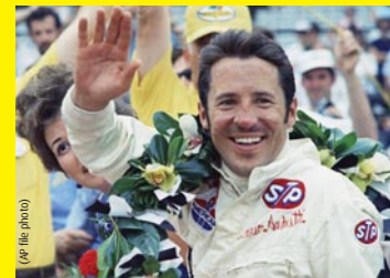
Mario Andretti in 1969