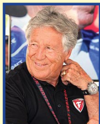
Mario Andretti in 2017

Since his retirement from full-time racing Mario keeps busy with speaking engagements and the role of spokesman for Texaco/Havoline, Firestone and Magnaflow. He owns a Toyota dealership, car washes, go-kart track and is involved in many other ventures.