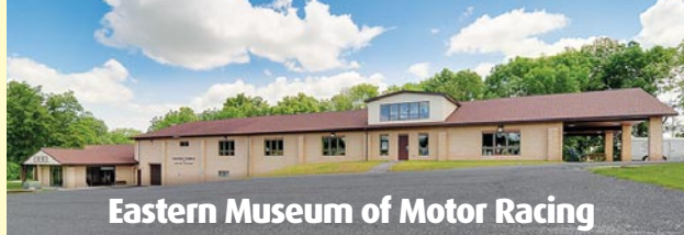
Eastern Museum of Motor Racing

5 pm- Race cars need to be at Williams Grove Speedway by 5:00 pm for EMMR Track Time. Questions? Contact Beth Wishard at 717-253-3467.