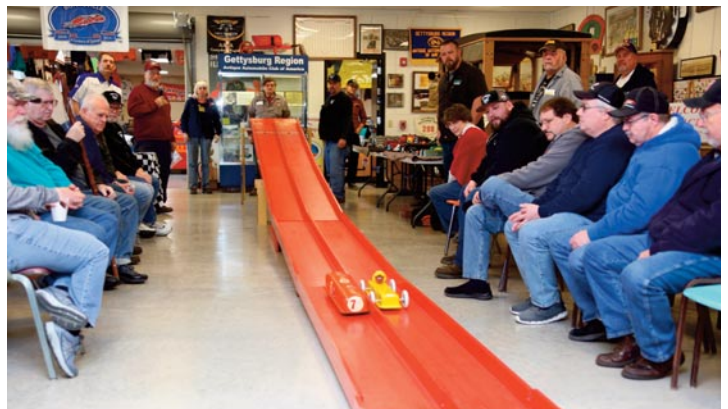
During the Drag Racing Party, a large crowd gathered to watch the 31 different valve cover racers compete for the coveted trophies.

PHOTOS OF THE MID-WINTER DRAG RACING PARTY ARE COURTESY OF “MASHIE”