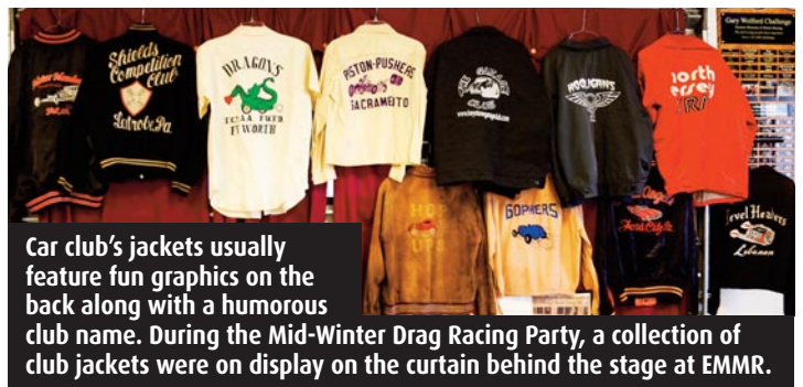
Car club’s jackets usually feature fun graphics on the back along with a humorous club name. During the Mid-Winter Drag Racing Party, a collection of club jackets were on display on the curtain behind the stage at EMMR.